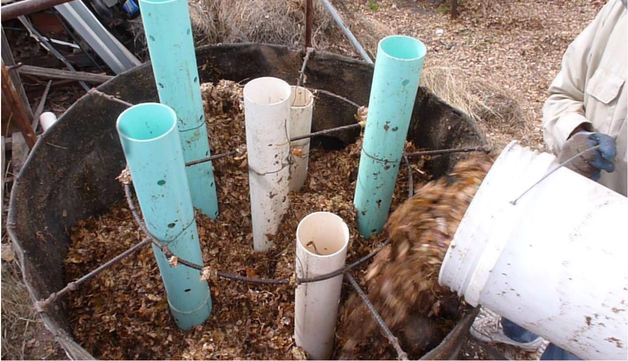
Figure 7. Filling the Bioreactor

Typically, I fill 6-9 buckets with wetted compost, dump each of these buckets into the bioreactor, then fill another 6-9 buckets and repeat the process.